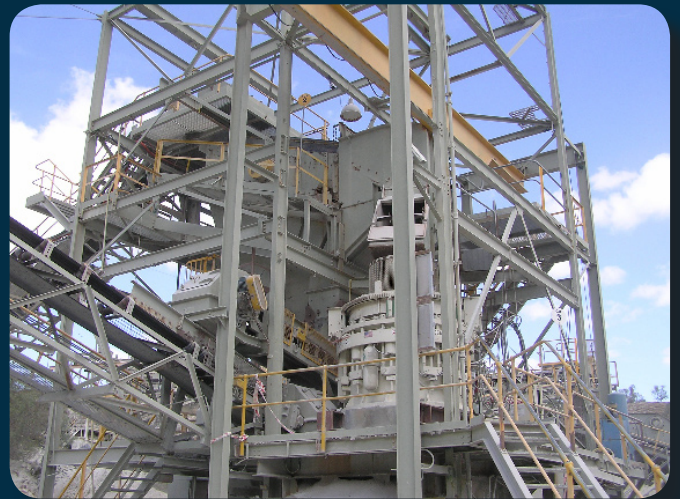
Photograph of Existing Facility

Project Details : Scope of work was for Laser Scanning and modelling for Secondary Crusher unit for future upgrade project. Laser scanning was carried during routine maintenance shutdown without hindering maintenance crews. 3D Primitive AutoCAD file Delivered to Client within one week of completion of site laser scanning.